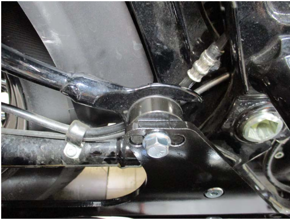
Proper installation for Heritage bag mount