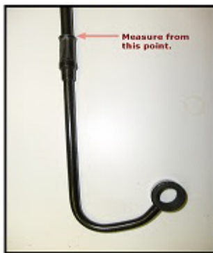
11-17 ABS Softail Measuring

2018 Softail - Upper line replacement when reusing the stock lower brake line. ( Adapter required ) Lengths are determined by using the stock master cylinder line for a guide. Measure from the lower brake line manifold where the upper line attaches up to the master cylinder. From that measurement, subtract 1.5" for the adapter and round up to the next number to determine upper line length. Use the images below to help with your measuring.