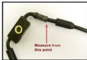
ABS Dyna/Sportster Measuring